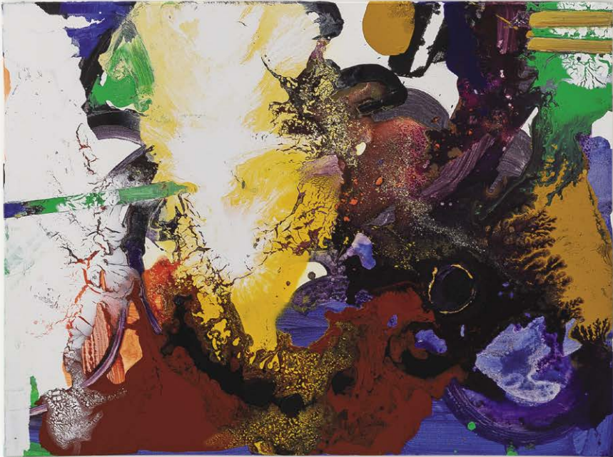
Dancing Off Score 2022 acrylic, oil, mixed media on canvas diptych 1525 x 1015mm