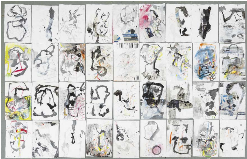
Score 36 pieces mixed media on paper A4 297 x 210mm

This body of work reflects the external and the internal imperatives that drive this artist to confront the challenges of today’s world. We can look at the paintings as a new life form, one that has not only adapted to change but is drawn from it, one that tells us something new about the world and how we can be a part of it.