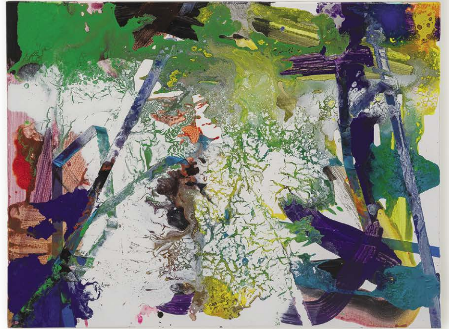
The Swan Plant and the Butterfly 2022 acrylic, oil, mixed media on canvas diptych 1525 x 1015mm