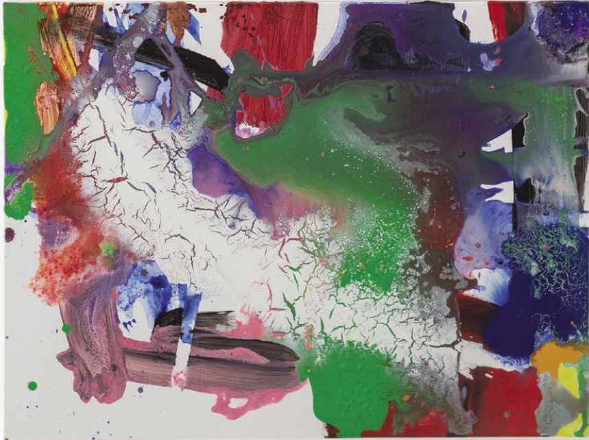
Sunflower 2022 acrylic, oil, mixed media on canvas diptych 1525 x 1015mm