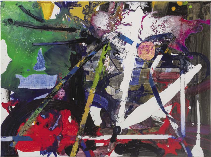
Digging for Gold 2022 acrylic, oil, mixed media on canvas diptych 1525 x 1015mm