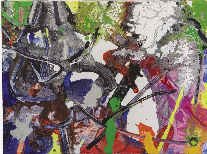
Cockatoos 2022 acrylic, oil, mixed media on canvas diptych 1525 x 1015mm