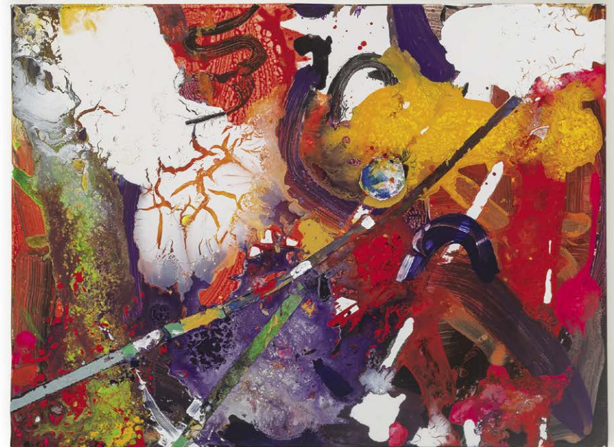
Salsa/Salseros 2022 acrylic, oil, mixed media on canvas diptych 1525 x 1015mm